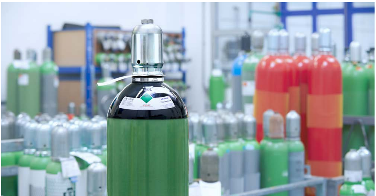
Pure gases in plenty of cylinder sizes

Tailored to the specific requirements of the particular application, Messer provides the products in different levels of purity. These range from technical gas to 6.0 quality, meaning a purity of 99.9999%, and delivery forms, from small cylinders to bundles with filling pressure of up to 300 bar, or even bulk supply.