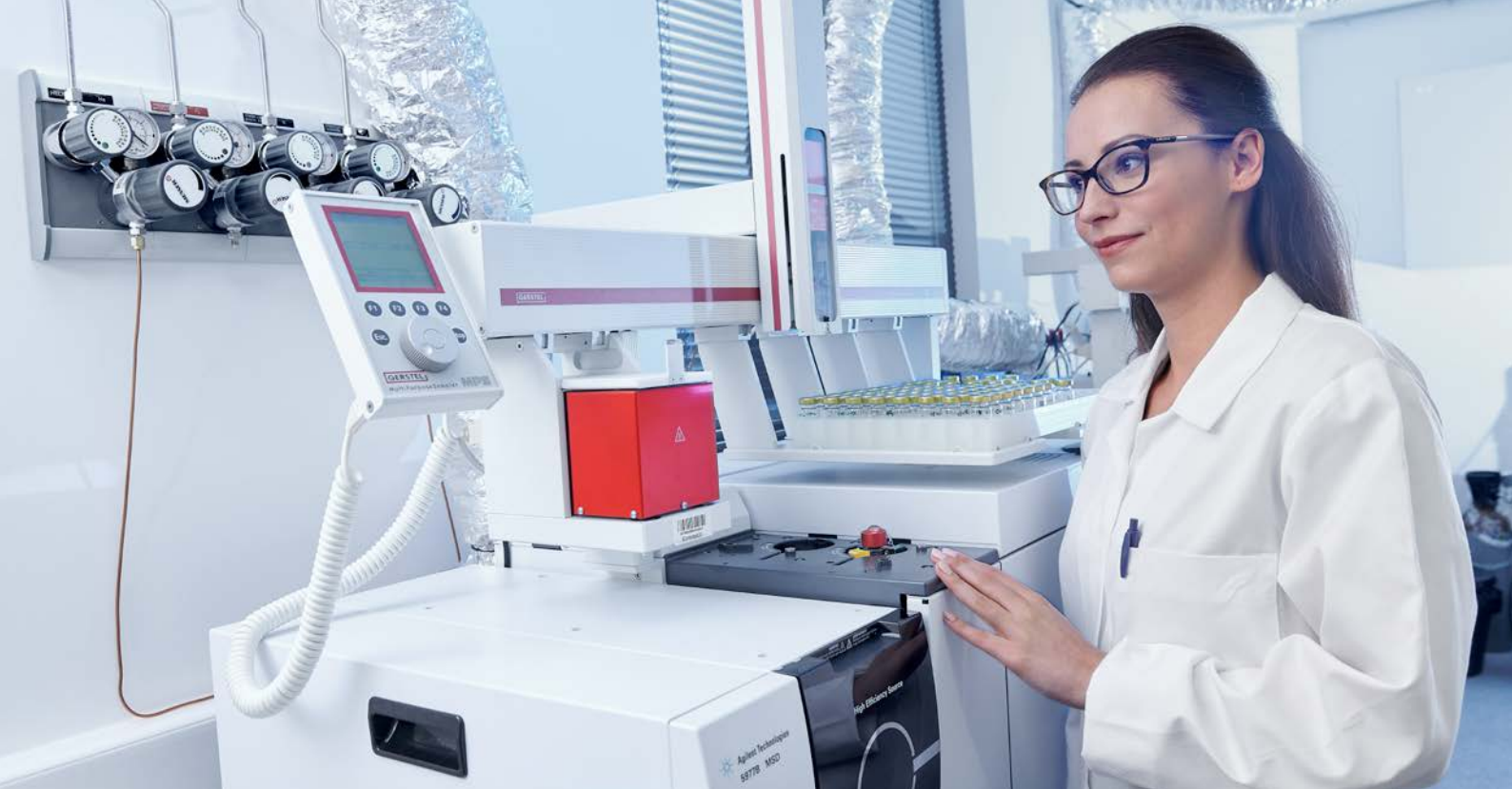
Calibration gases for analytical applications