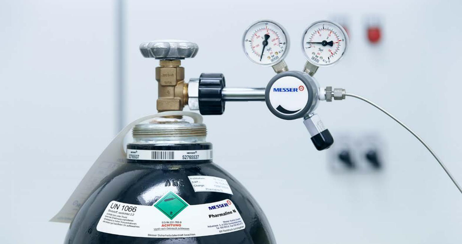
Individual cylinder at the point of use with cylinder pressure regulator