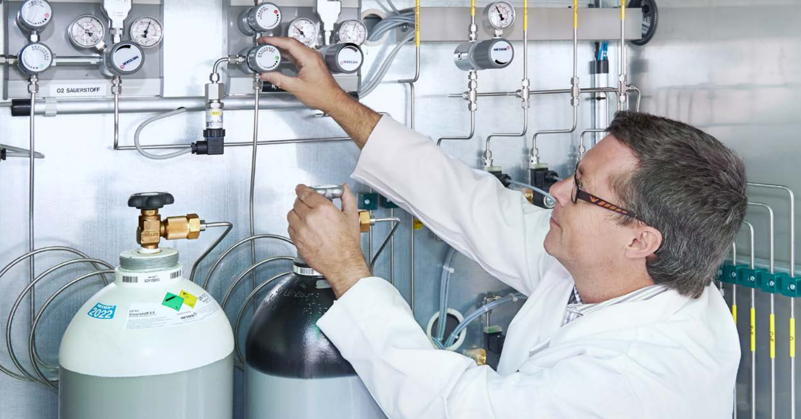
Central gas supply system